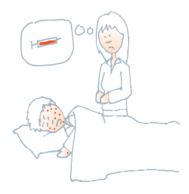
Your child needs 2 doses of MMR. Ask your nurse, health visitor or doctor for advice about children's vaccines.